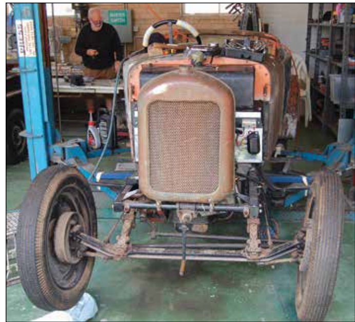
The Singer shows off its newly installed radiator while Kevin prepares other bits and pieces in the background.

has served only as a garage for the lawn mowers and it is worth more for what it can bring on the open market than as a mobile garage.