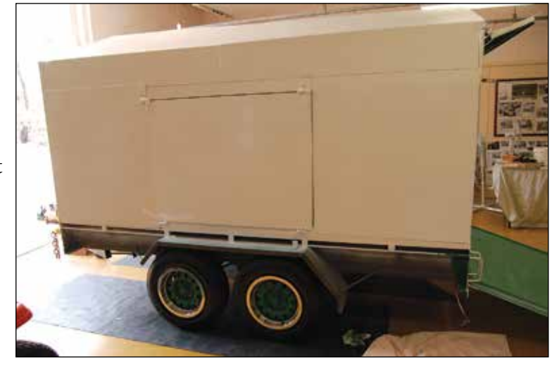
The trailer almost complete, just waiting for better weather so the underbody can be painted.

Be there at 11.30 for a 12 noon lunch. Further details more do you need?